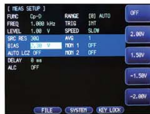
Internal Bias ( \pm 2.5V Adjustable) Ideal for Capacitive Components' Characteristic Tests