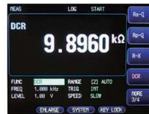
D.C. Resistance Measurement Ideal for inductive components' D.C. Characteristics Verification

To satisfy the diverse measurement application requirements for different components and materials, the LCR-6000 series collocates with many auxiliary measurement functions. For capacitor measurement, Automatic Level Control (ALC) is mainly for component which requires a constant or rated test voltage such as multi-layer ceramic capacitor (MLCC). An internal D.C. bias voltage ( \pm 2.5V , internal) is allowing simulating A.C. and D.C.