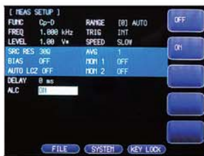
Automatic Level Control Ideal for Measuring Components With Voltage Requirements