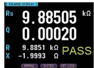
MEAS Display Parameter Setting and Four Measurement Parameters