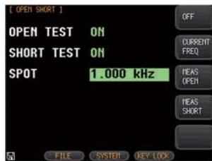
Consecutive and Adjustable Frequency Selectable Fixture Zeroing Methods Freely Input Frequency Within Provided Full Frequency Range Zero or Spot Zero Frequency Range

The LCR-6000 series, within the provided frequency range, features consecutive and adjustable frequency capability which allows users to conduct measurement and analysis on components with the most genuine frequency requirements. For OPEN/SHORT fixture compensation function, the LCR-6000 series is equipped with full frequency range zero and spot zero selections. After executing full frequency range zero, users, under the conditions of not turning off the power and not changing test fixture, can freely change test frequency for the LCR-6000 series to execute component measurements that tremendously saves time in repeatedly zeroing test fixture after changing frequency.